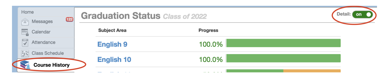
Step 1: Review your credits. Login to Student Vue. Find the chart below and pay close attention to "Remaining"